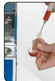
Inject Next Sample